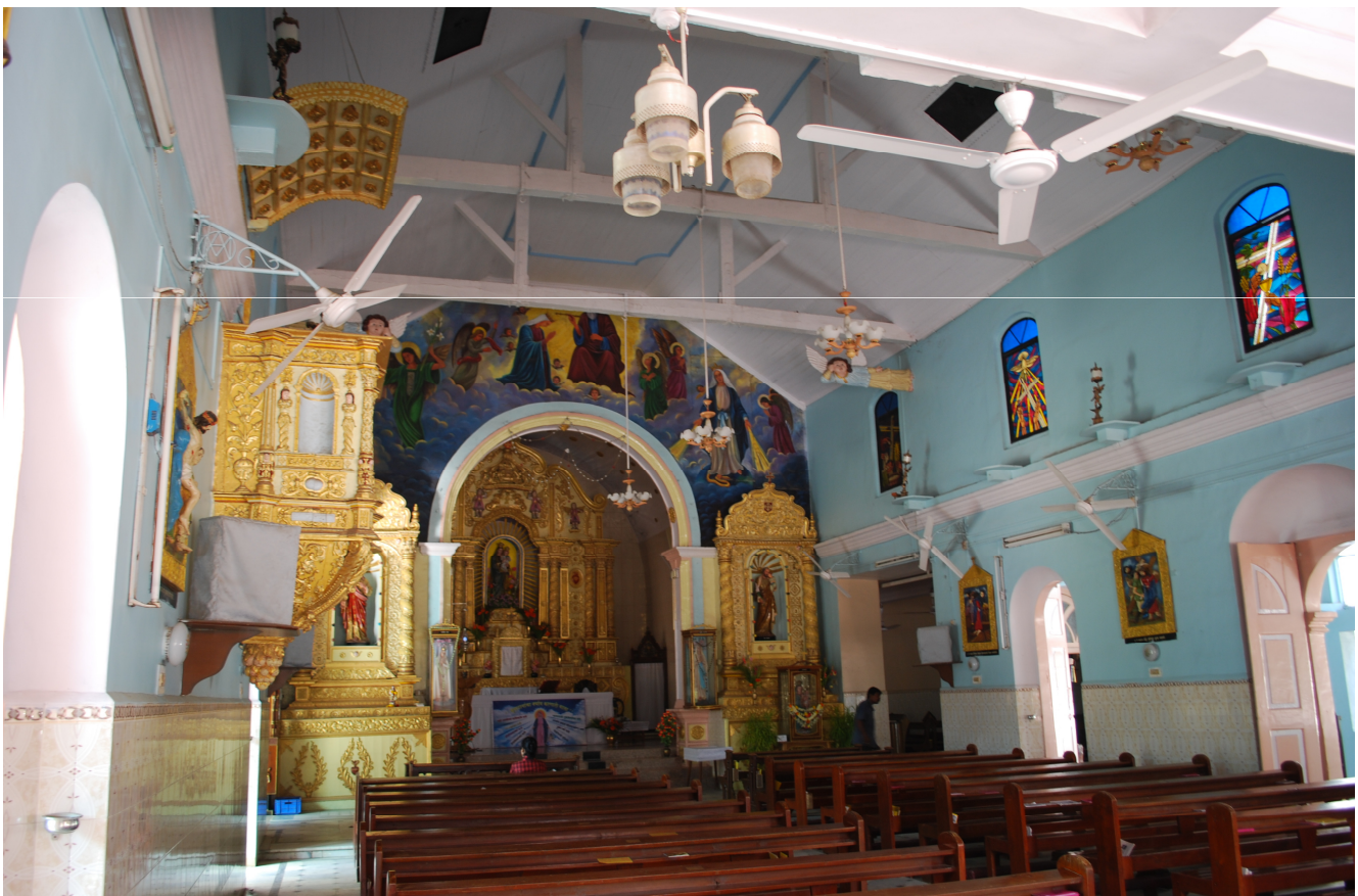
Double height volume of the with queen post roof truss