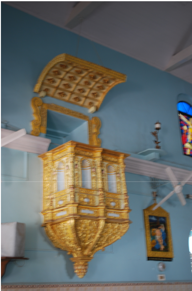
Intricately decorated pulpit