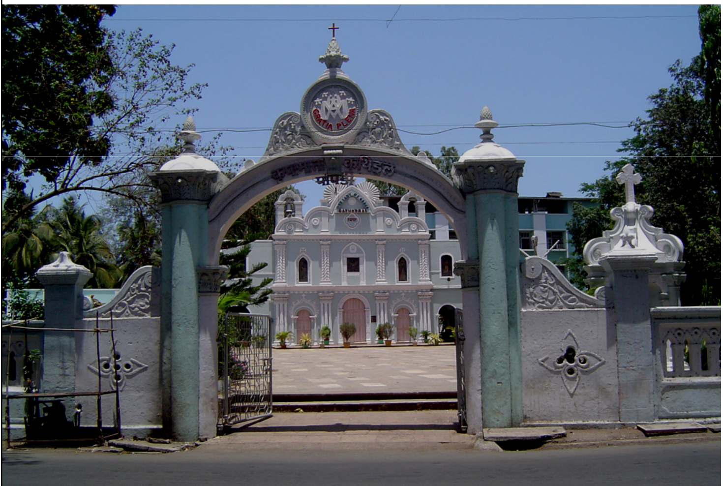
One of the oldest surviving false front façades of the churches within the Vasai – Virar Region