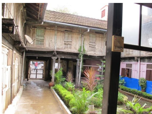
Site visit to Thane with Adarkar Associates

The Sub-Committee reviewed the final report of the project in its 75th meeting. The Board of Governors concluded the project in its meeting held on 28 th February 2014.