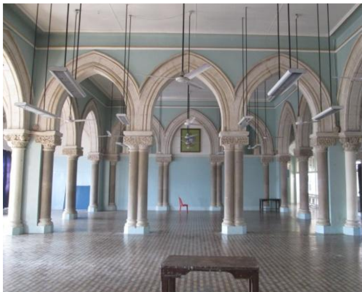
BJPC School after restoration

The proponent submitted the final report to the Society's office for the review by the Sub-Committee. The Board of Governors concluded the project in their 42nd meeting held on 28th February 2014.