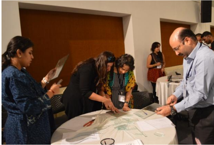
Hands-on Experience for Participants in the BHSC Programme