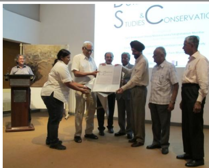
Inauguration of the programme

The Board of Governors in its meeting held on 22 nd March 2011 suggested that a training programme on capacity building needs to be developed for various stakeholders involved with heritage conservation. Accordingly, the Society's office prepared the proposal and the Sub-Committee of the Society discussed the various aspects of the training programme in its