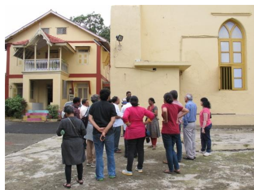
Site visit to Thane with Adarkar Associates