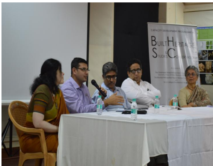
Panel Discussion in the BHSC Programme