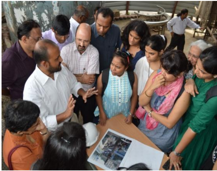
Site Visit in the BHSC Programme